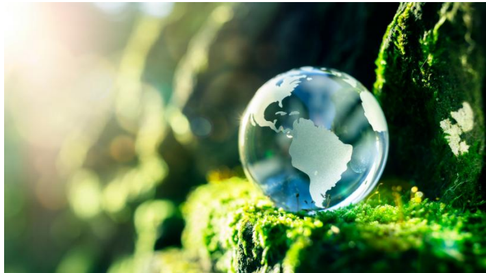
RAM Active Investments