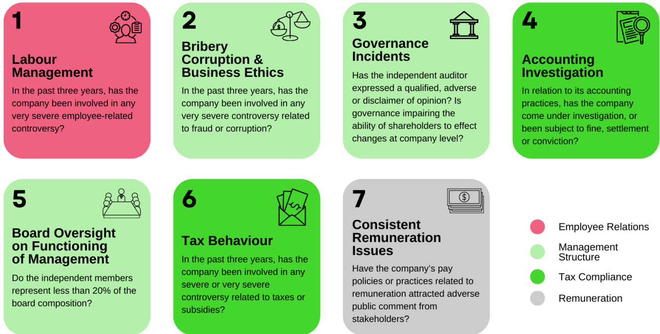
Figure 1: RAM AI's Good Governance Metrics. Metric 1 relates to Employee Relations, Metric 2, 3 and 5 relate to Management Structure. Metric 4 and 6 relate to Tax compliance. Metric 7 relates to Remuneration.

Leveraging on an extensive ESG dataset, built from various data sources such as third-party agencies and companies’ financial and non-financial reports, we have built a multi-step good governance process that include seven binary metrics (Yes or No) reflecting the SFDR requirements.